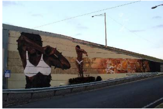
Paz para la mujer 1 y 2.