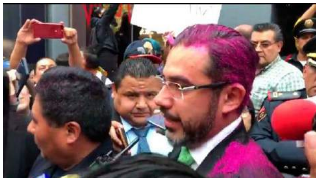
Fotografía 2