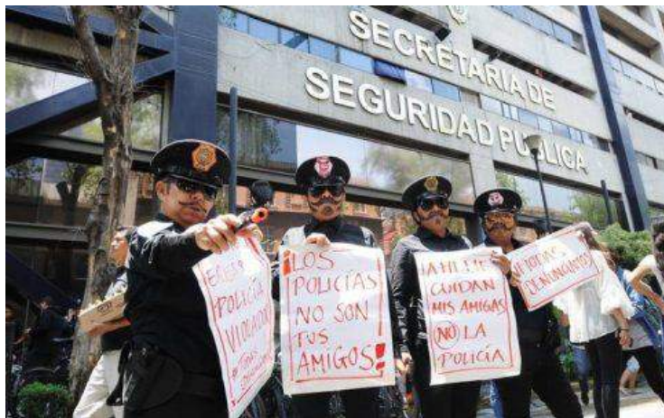
Fotografía 1

Ahora bien, para entender la importancia de las marchas feministas en Ciudad de México y su relación con el apocalipsis es necesario conocer el proceso que las detonó. El 6 de agosto de 2019, una joven de 17 años denunció haber sido violada por cuatro policías mientras caminaba hacia su casa en Azcapotzalco, al norte de Ciudad de México. A ese caso se