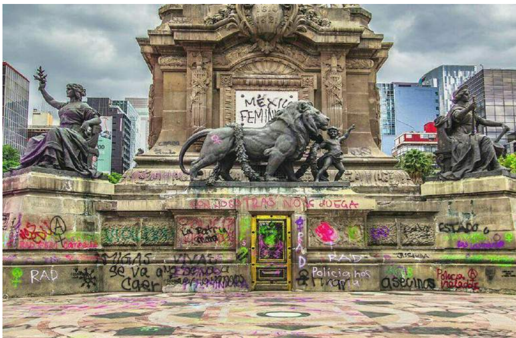
Fotografía 3

esta indignación no sólo se hace presente, sino que se materializa en las estatuas rayadas e intervenidas que configuran el espacio ciudadano.